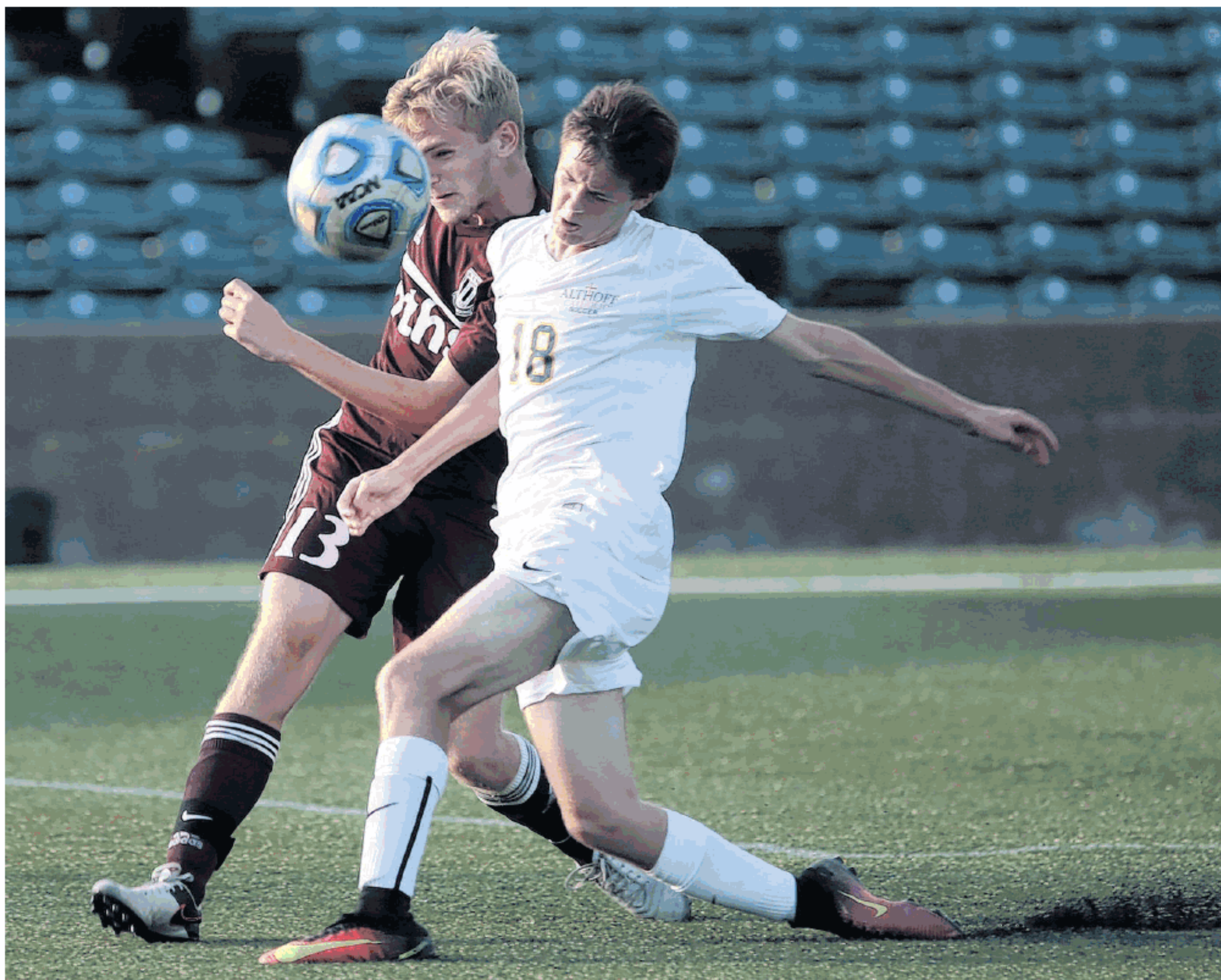
ZIA NIZAMI News-Democrat